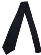
Black Tie, Plain