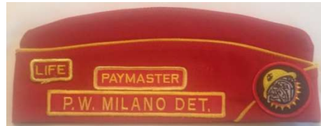
Shown with MODD patch ↑↑

↑↑ Standard Cover worn by ALL members of the MCL ↑↑