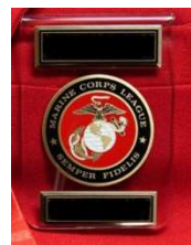
Red Blazer Custom Pocket Inserts (MARINEcrest.com)

All are authorized for wear on the Red Blazer.