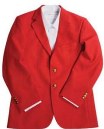
Red Blazer – Male