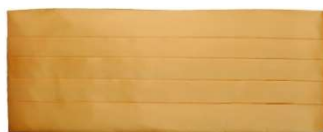
Male Gold Cummerbund