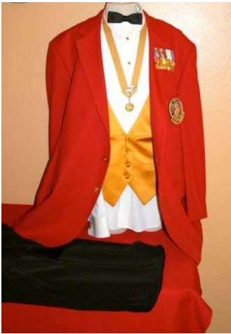
RED BLAZER FORMAL