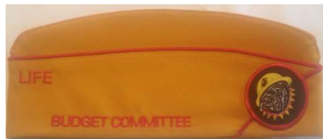
Shown with MODD patch ↑↑

When Marine Corps League Members are wearing the appropriate cover, they are considered to be in uniform. NO OTHER TYPE OF COVER MAY BE WORN AT A MARINE CORPS LEAGUE FUNCTION OR MEETING. We are seeing more MCL members with pins and devices of all kinds on their covers. If you got them on your cover, you need to remove them. They DO NOT belong on the cover.