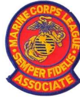
Left Sleeve Patch