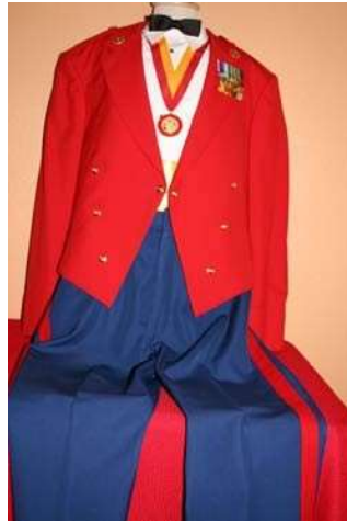
EVENING DRESS JACKET DRESS BLUE TROUSERS WITH RED NCO STRIPE