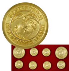
Red Blazer buttons – large & small