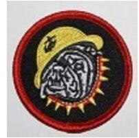
MODD Cover Patch