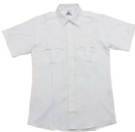
White Short Sleeve Aviator Style