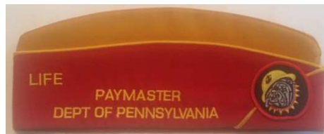
Shown with MODD patch ↑↑