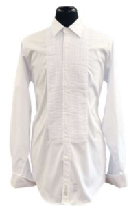
Tuxedo Shirt White Flat Collar, Pleated Front