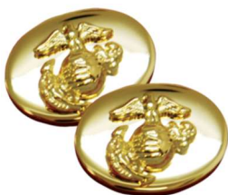
Cuff Links Gold