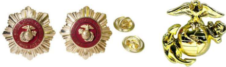
Regular Member – Short Sleeve Collar Ornaments & MCL Cover Gold Enlisted EGA