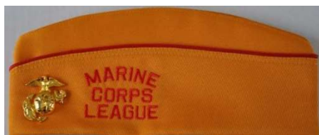
National Officer Cover or MODD Kennel Officer Cover