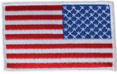
American Flag OR MODD Patch – Right Sleeve (Wearers Choice)