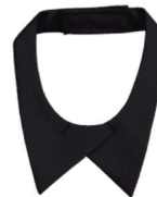
Black Female Necktab