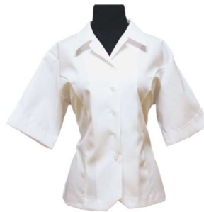
Women's White USMC Style Short Sleeve