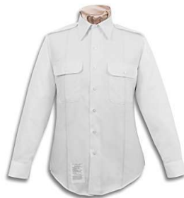
White Long Sleeve Aviator Style