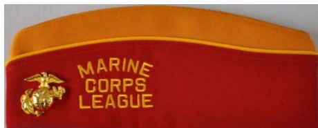
Department Officer Cover or MODD Pack Officer Cover