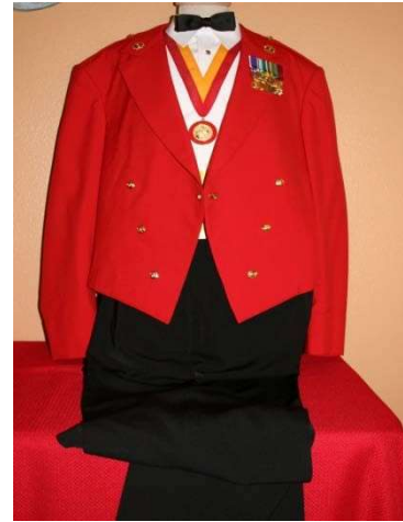
EVENING DRESS JACKET BLACK TUXEDO TROUSERS OR BLACK TROUSERS WITH BLACK LEATHER DRESS BELT