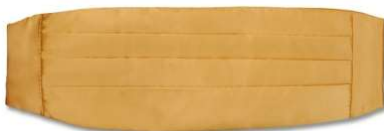
Female Gold Cummerbund