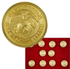
MCL Evening Dress Mess Button Set