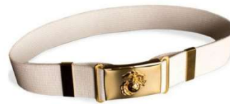
White Web Belt (Regular Member) (Assoc. Member - Plain) (ONLY to be worn when performing the duties of Sgt-at-Arms, Color Guard, Honor Guard)