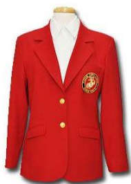
Red Blazer – Female