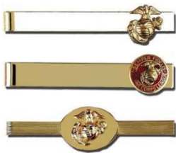
All three Tie Bars are authorized for wear