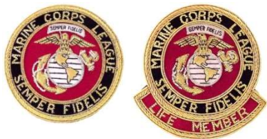
Red Blazer Crests