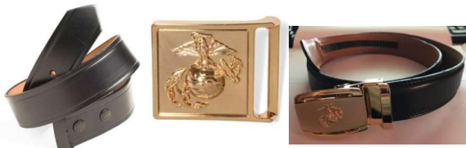
Black Leather Belt (Both are authorized for wear)