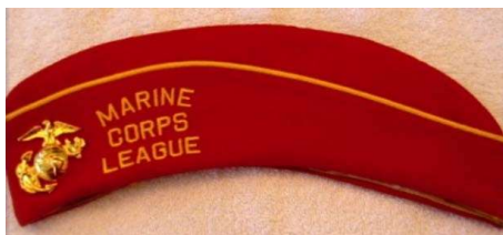
Regular Member – FEMALE